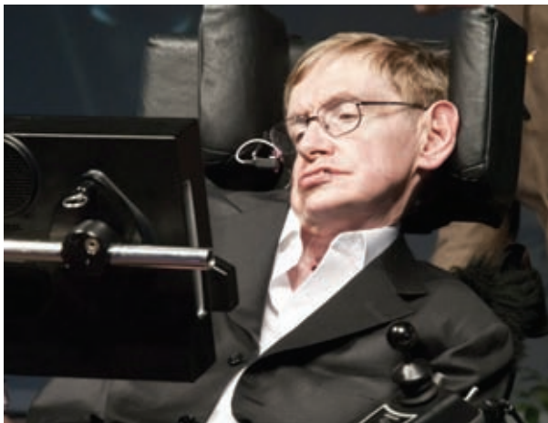
Professor Stephen Hawking

MND is a devastating disease, whose most famous sufferer is Cambridge astrophysicist Professor Stephen Hawking. The MND Association is funding an exciting international study involving teams from Edinburgh University, King's College, London and Columbia University in New York, based on human motor neurons created from MND patients' skin cells.