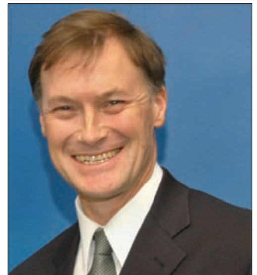
David Amess MP

*You can check our website or call us to find out if they have already signed – if so, you could change the wording to thank them instead!