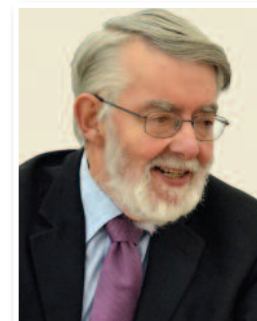
Paul Flynn MP (Labour)