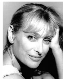
Carol Royle Actress

“ No other area of science still relies on the flawed methods of 50 years ago. We must move safety testing into the 21st century – for all our sakes. ”