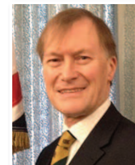
Sir David Amess MP (Conservative)