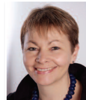
Caroline Lucas MP (Green Party Co-Leader)

“ No other area of science still relies on the flawed methods of 50 years ago. We must move safety testing into the 21st century – for all our sakes. ”